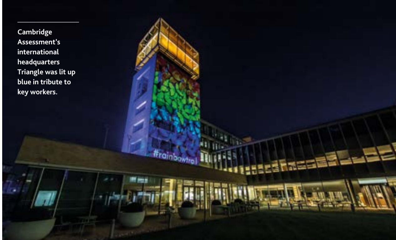
Cambridge Assessment's international headquarters Triangle was lit up blue in tribute to key workers.