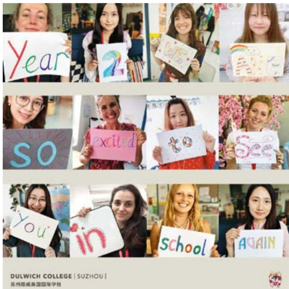
Dulwich College, Suzhou, China